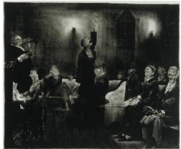
Title: Prayer Meeting No. 2 Date: 1916 Primary Maker: George Wesley BELLOWS Medium: lithograph on paper