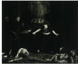
Title: The Last Victim Date: 1918 Primary Maker: George Wesley BELLOWS Medium: lithograph on paper