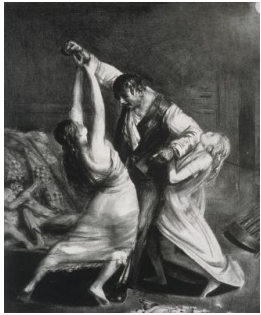
Title: The Drunk, No.1 Date: 1923-24 Primary Maker: George Wesley BELLOWS Medium: lithograph on paper