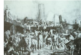
Title: River Front Date: 1923-24 Primary Maker: George Wesley BELLOWS Medium: lithograph on paper