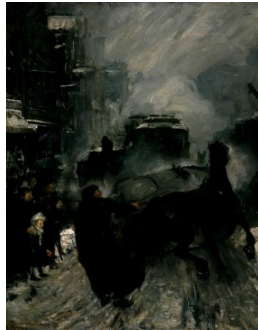
Title: Steaming Streets Date: March 1908 Primary Maker: George Wesley BELLOWS Medium: oil on canvas