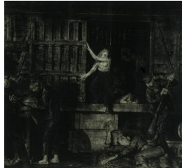
Title: Return of the Useless Date: 1918 Primary Maker: George Wesley BELLOWS Medium: lithograph on paper