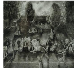
Title: Tennis Date: 1920 Primary Maker: George Wesley BELLOWS Medium: lithograph on paper