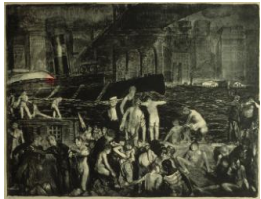
Title: Splinter Beach Date: 1916 Primary Maker: George Wesley BELLOWS Medium: lithograph on paper, ed. 62/70