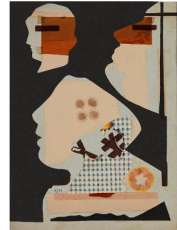
Title: Swanage, Dorset Date: 1935 Primary Maker: Eileen AGAR Medium: collage with ink wash, pencil shaving, and cellophane on pressed board