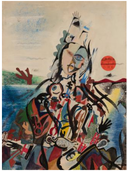
Title: Madonna of the Setting Sun Date: 1942 Primary Maker: Eileen AGAR Medium: collage with ink, watercolor and crayon