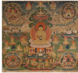
Title: Buddha Amitabha and His Paradise Date: 18th-19th century Primary Maker: Tibet Medium: ink, color, and gold on cloth