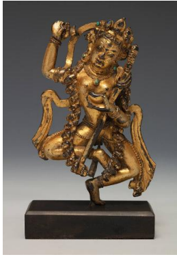
Title: Dancing Vajravarahi, Buddhist Wrathful Goddess Date: 13th century Primary Maker: Tibet Medium: gilt bronze