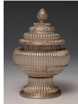
Title: Container with Lid Date: early 20th Century Primary Maker: Tibet Medium: beaten silver