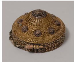
Title: Chased Betel Nut Box Date: 18th Century Primary Maker: Tibet Medium: copper, brass