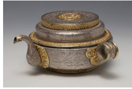
Title: Ewer with Lid Date: 20th Century Primary Maker: Tibet Medium: silver with gold wash mounts