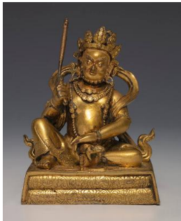
Title: Kubera, God of Wealth Date: 18th Century Primary Maker: Tibet Medium: gilt copper alloy