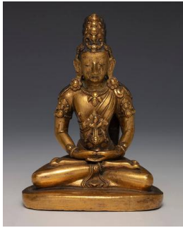
Title: Amitayus, Buddha of Infinite Life Holding an Auspicious Vase Date: 18th century Primary Maker: Tibet Medium: gilt bronze