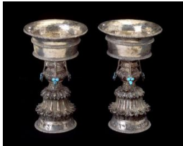
Title: Butter Lamp Date: 1938 Primary Maker: Tibet Medium: silver with inlaid turquoise, inscription