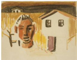
Title: Untitled Date: 1960 Primary Maker: David PARK Medium: felt-tip pen on paper