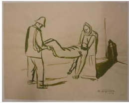
Title: El hijo muerto Date: 1943 Primary Maker: Raúl ANGUIANO Medium: ink and wash on paper