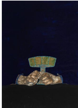
Title: from "The Last Supper" Date: 1992 Primary Maker: Basil ALKAZZI Medium: gouache on paper