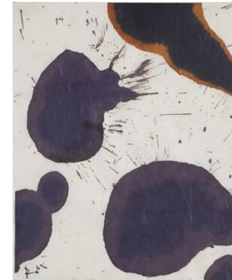
Title: Lyric Suite Date: 1965 Primary Maker: Robert MOTHERWELL Medium: ink on rice paper