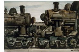
Title: Two Engines Date: 1937 Primary Maker: Dan LUTZ Medium: watercolor on paper, recto/verso