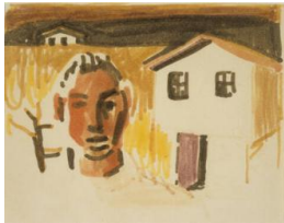
Title: Untitled Date: 1960 Primary Maker: David PARK Medium: felt-tip pen on paper