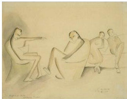
Title: Untitled (Reginald Pole, Laurence Tibbett) Date: 1925 Primary Maker: Beatrice WOOD Medium: watercolor and pencil on paper