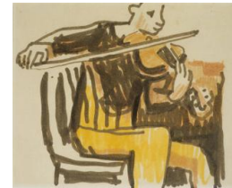
Title: Seated Violin Player Date: ca. 1955 Primary Maker: David PARK Medium: felt-tip pen on paper