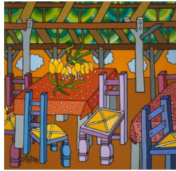
Title: Cafe at Mazatlan Date: 1971 Primary Maker: Phoebe BRUNNER Medium: acrylic on canvas