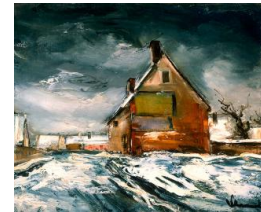
Title: Snowy Landscape Date: 1930s Primary Maker: Maurice de VLAMINCK Medium: oil on canvas