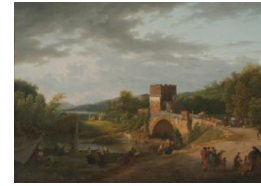
Title: View of the Ponte Salario near Rome Date: ca. 1810 Primary Maker: Jean-Joseph-Xavier BIDAULD Medium: oil on canvas