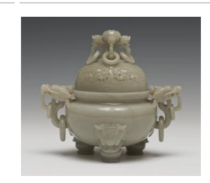
Title: Tripod Censer with Reticulated Cover and Dragon Design Date: late 19th-early 20th century Primary Maker: China Medium: grayish-green nephrite jade