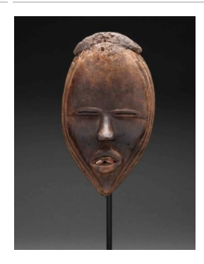
Title: Mask Date: 20th century Primary Maker: Dan artist, Côte d'Ivoire or Liberia Medium: wood