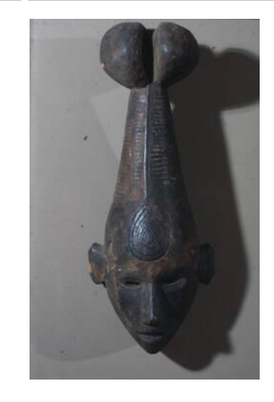
Title: Oqbom Mask Date: n.d. Primary Maker: UNKNOWN Medium: wood (carved by Ibibio artist)