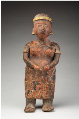
Title: Female figure Date: ca. 200 BCE-400 CE Primary Maker: Nayarit Medium: ceramic