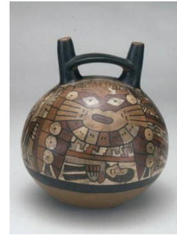
Title: Double spout and bridge vessel with mythological being Date: ca. 400-600 CE Primary Maker: Nazca Medium: ceramic