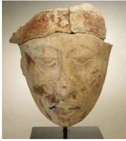
Title: Head Date: ca. 600-900 CE Primary Maker: Maya Medium: limestone, stucco and paint