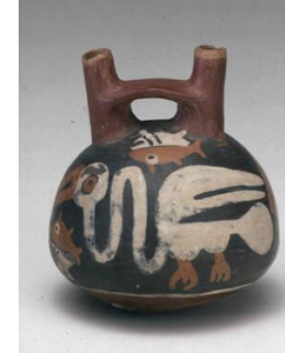
Title: Double spout and bridge vessel with water birds and fish Date: 100-400 CE Primary Maker: Nazca Medium: ceramic