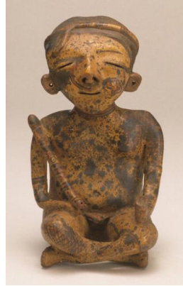
Title: Seated figure Date: 100-400 CE, Protohistoric Primary Maker: Chinesco, Southwest Nayarit Medium: ceramic with ochre slip