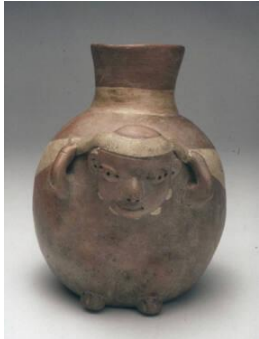
Title: Vessel with figure using tumpline Date: 300-400 CE Primary Maker: Gallinazo Medium: ceramic