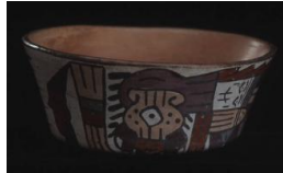
Title: Bowl with trophy heads Date: ca. 300-600 CE, Late Nazca Primary Maker: Nazca Medium: ceramic