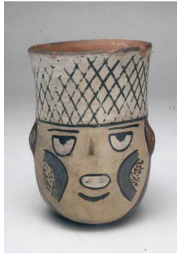
Title: Head vessel Date: ca. 400-600 CE, Late Nasca Period Primary Maker: Nazca Medium: ceramic