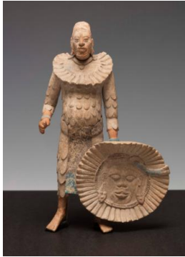
Title: Standing warrior Date: 600-900 CE Primary Maker: Maya, Jaina- style Medium: terracotta