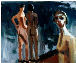
Title: Three Women Date: 1957 Primary Maker: David PARK Medium: oil on canvas