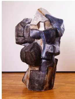
Title: Sitting Bull Date: 1959 Primary Maker: Peter VOULKOS Medium: stoneware, wheel-thrown and paddled parts, slip and glaze