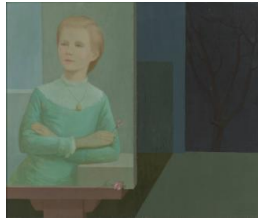
Title: The Portrait Date: 1953 Primary Maker: Helen LUNDEBERG Medium: oil on canvas