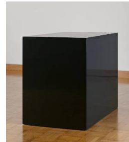
Title: Untitled Date: 1977 Primary Maker: John MCCracken Medium: polyester resin, fiberglass, plywood