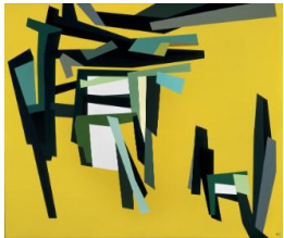
Title: FS #1 Date: 1961 Primary Maker: Karl BENJAMIN Medium: oil on canvas