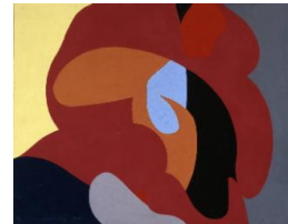
Title: Left field Date: 1964 Primary Maker: Frederick HAMMERSLEY Medium: oil on chipboard