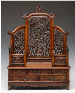
Title: Mirror Stand Date: Qing dynasty, late 17th-18th century Primary Maker: China Medium: wood, metal