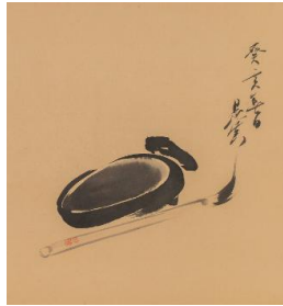
Title: Inkstone and Brush Date: 1863 Primary Maker: Shibata ZESHIN Medium: ink and light wash of color on paper; hanging scroll