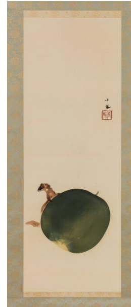
Title: Weasel and Melon Date: n.d. Primary Maker: Takeuchi SEIHŌ Medium: ink and light color on silk; hanging scroll