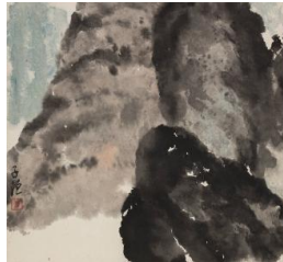
Title: Landscape Date: n.d. Primary Maker: CUI Zifan Medium: ink and color on paper; hanging scroll