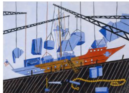
Title: Decomissioning the Sea Cloud Date: 1944 Primary Maker: Jacob LAWRENCE Medium: watercolor on paper