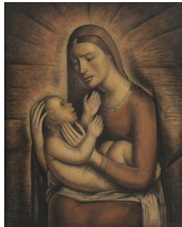
Title: Virgen y niño Date: 1935 Primary Maker: Alfredo RAMOS MARTÍNEZ Medium: charcoal and gilt paint on paper