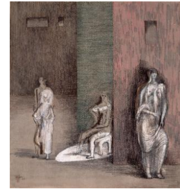
Title: Three Figures in a Setting Date: 1942 Primary Maker: Henry MOORE Medium: Pencil, wax, crayon, ink, and ink wash on grey paper