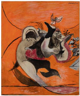
Title: Horned Tree Form Date: 1946 Primary Maker: Graham SUTHERLAND Medium: wax crayon, ink, pencil and gouache