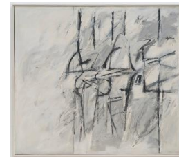
Title: Sky Date: 1954 Primary Maker: Jack TWORCKOV Medium: oil on canvas