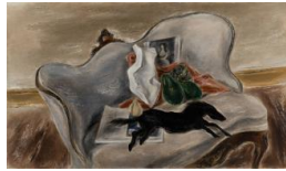
Title: Weather Vane and Objects on a Sofa Date: 1933 Primary Maker: Yasuo KUNIYOSHI Medium: oil on canvas