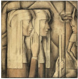
Title: Monjas ante la crucifixión Date: ca. 1938 Primary Maker: Alfredo RAMOS MARTÍNEZ Medium: pastel and Conté crayon on paper