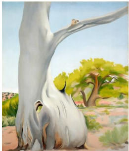
Title: Dead Cottonwood Tree Date: 1943 Primary Maker: Georgia O'KEEFFE Medium: oil on canvas