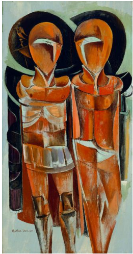
Title: Red and Black Principle Date: 1936 Primary Maker: Wyndham LEWIS Medium: oil on canvas