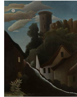
Title: Castle in Moonlight (Le Donjon) Date: 1889 Primary Maker: Henri ROUSSEAU Medium: oil on canvas