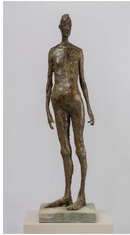
Title: The Leaf (La Feuille) Date: 1948 Primary Maker: Germaine RICHIER Medium: bronze