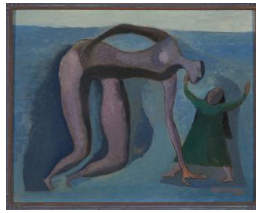
Title: Mujer y niña Date: 1940 Primary Maker: Carlos OROZCO ROMERO Medium: oil on board