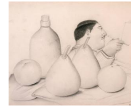
Title: Self-Portrait with Still Life Date: 1979 Primary Maker: Fernando BOTERO Medium: graphite and chalk on paper