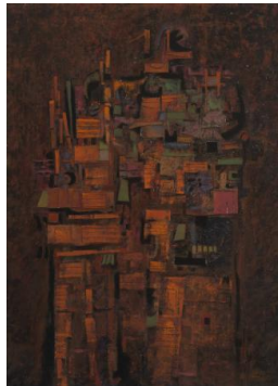
Title: Dos personajes Date: 1956 Primary Maker: Gunther GERZSO Medium: oil on canvas board