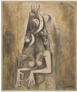
Title: The Casting of the Spell Date: 1947 Primary Maker: Wifredo LAM Medium: oil on burlap