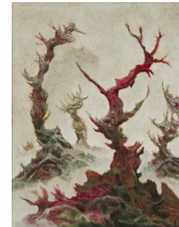
Title: Abstract of Trees Date: 1964 Primary Maker: Guillermo MEZA Medium: oil on masonite