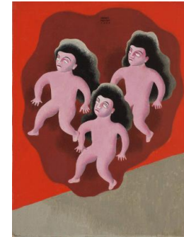
Title: Fuga (Escape) Date: 1940 Primary Maker: Carlos MÉRIDA Medium: oil on canvas