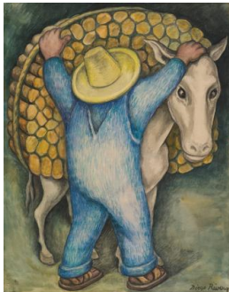
Title: Man Loading Donkey with Firewood Date: 1938 Primary Maker: Diego RIVERA Medium: graphite and watercolor on paper