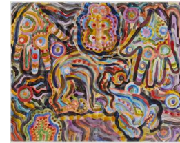
Title: Peaceable Kingdom Date: 2017 Primary Maker: Jim DRAIN Medium: acrylic and colored pencil on Bristol paper