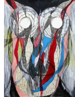
Title: Untitled (Idling) Date: 2018 Primary Maker: Naotaka HIRO Medium: acrylic and graphite on paper