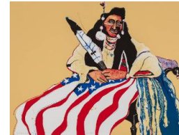
Title: Bicentennial Indian, from the portfolio, "Spirit of Independence, Kent Bicentennial"

Medium: lithograph on copper plate, ed. H.C. 18/25