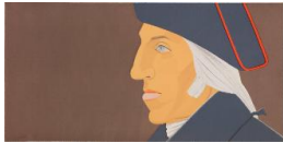
Title: Washington, from the portfolio, "Spirit of Independence, Kent Bicentennial"