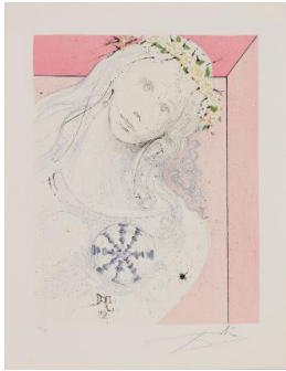
Title: As Pure as Her Heart, from the portfolio, "25 Lithographs of Original Gouaches Based On Three Plays by the Marquis de Sade"