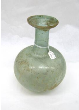
Title: Bottle Date: 3rd-5th century CE Primary Maker: Roman, Eastern Mediterranean Medium: glass