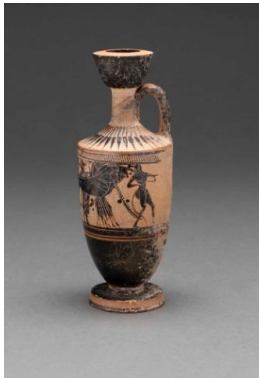
Title: Black-figure lekythos (oil bottle) Date: ca. 490 BCE Primary Maker: HAIMON PAINTER Medium: ceramic