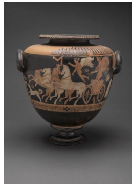
Title: Red-figure stamnos (wine vessel) Date: ca. 370 BCE Primary Maker: PAINTER OF VILLA GIULIA 43969 Medium: ceramic