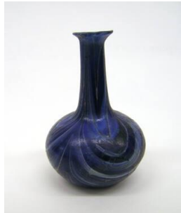
Title: Bottle Date: 1st century CE Primary Maker: Roman, Italian Medium: glass