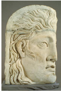
Title: Corner mask from a sarcophagus Date: last third of 3rd century CE Primary Maker: Roman Medium: marble