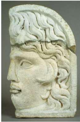
Title: Corner mask from a sarcophagus Date: last third of 3rd century CE Primary Maker: Roman Medium: marble