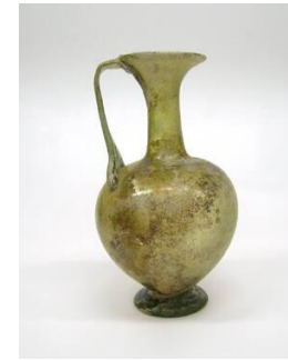
Title: Pitcher Date: 3rd-4th century CE Primary Maker: Roman, Eastern Mediterranean Medium: glass