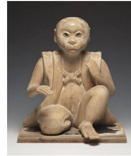
Title: One of a Pair of Monkeys Date: Muromachi Period (1392 - 1573) Primary Maker: Japan Medium: wood with traces of pigments and painted crystal eyes