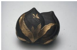
Title: Box in the Form of Double Peach Date: Edo period, first half of 19th century Primary Maker: Japan Medium: lacquer on wood decorated with gold takamaki-e