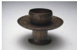
Title: Teacup Stand Date: Edo period, 18th century Primary Maker: Japan Medium: black lacquer on wood with gold and pewter nashiji-e and hiramaki-e