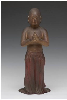
Title: Prince Shōtoku Taishi as a Child Praying to the Buddha Date: Muromachi period (1336-1573) Primary Maker: Japan Medium: wood with traces of polychrome, crystal eyes