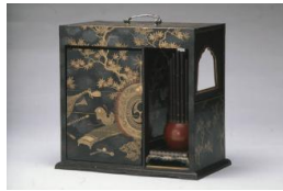
Title: Picnic Set with Food Boxes and a Sake Bottle Date: Edo-Meiji period, late 19th century Primary Maker: Japan Medium: lacquer and gold on wood; gold, silver, and red nashiji-e and hiramaki-e lacquer; metal handle and fittings; signed "Ipposai"