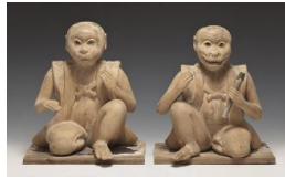
Title: One of a Pair of Monkeys Date: Muromachi Period (1392-1573) Primary Maker: Japan Medium: wood with traces of pigments and painted crystal eyes