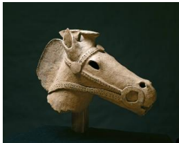
Title: Haniwa Horse Head Date: 6th century Primary Maker: Japan Medium: earthenware