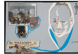
Title: Black Revue, from the portfolio, "the Boston Massacre" Date: 1970 Primary Maker: Larry RIVERS Medium: embossed and collaged screenprint, ed. 84 /150