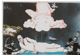
Title: Victims, from the portfolio, "the Boston Massacre" Date: 1970 Primary Maker: Larry RIVERS Medium: embossed and collaged screenprint, ed. 84 /150