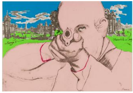
Title: Ready-Aim, from the portfolio, "the Boston Massacre" Date: 1970 Primary Maker: Larry RIVERS Medium: embossed and collaged screenprint, ed. 84 /150