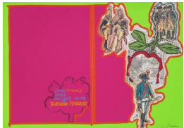
Title: Some (Visual) Afterthoughts on the Boston Massacre, from the portfolio, "the Boston Massacre" Date: 1970 Primary Maker: Larry RIVERS Medium: embossed and collaged screenprint, ed. 84 /150