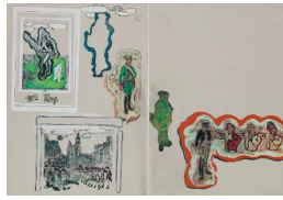
Title: 40th Regiment, from the portfolio, "the Boston Massacre" Date: 1970 Primary Maker: Larry RIVERS Medium: embossed and collaged screenprint, ed. 84 /150