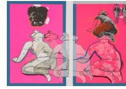
Title: Observation, from the portfolio, "the Boston Massacre" Date: 1970 Primary Maker: Larry RIVERS Medium: embossed and collaged screenprint, ed. 84 /150