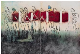
Title: Redcoats - Mist, from the portfolio, "the Boston Massacre" Date: 1970 Primary Maker: Larry RIVERS Medium: embossed and collaged screenprint, ed. 84 /150