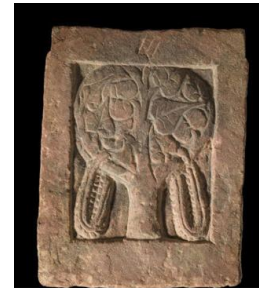
Title: Bodhi Tree Date: 1st-3rd century Primary Maker: India, Uttar Pradesh, Mathura Medium: red mottled sandstone