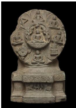
Title: Jain Digambara Mandala of the Nine Divinities (Navadevata), with Gajalakshmi and auspicious symbols on base Date: 14th century Primary Maker: India, Karnataka Medium: stone (granite)