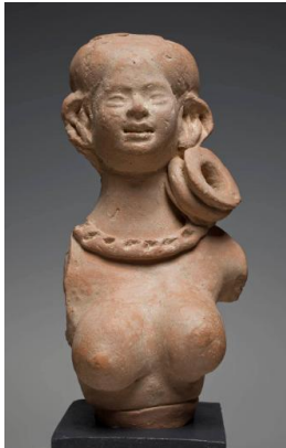
Title: Female Figure Date: 320-200 BCE Primary Maker: India Medium: hand-modeled terracotta