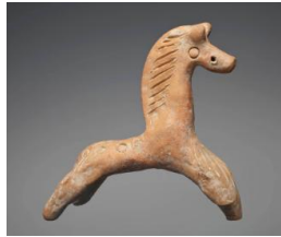
Title: Horse Date: 320-200 BCE Primary Maker: India, Pataliputra (modern-day Patna, Bihar) Medium: hand-modeled terracotta with red slip