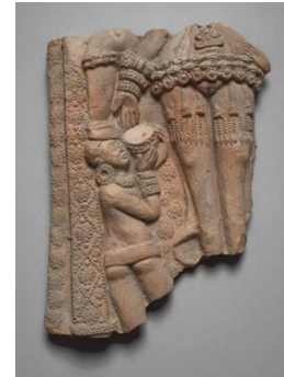
Title: Fragment of Female Figure with Attendant Date: 2nd-1st century BCE Primary Maker: India, West Bengal, Chandraketugarh Medium: terracotta