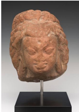
Title: Head of Shiva Date: 6th century Primary Maker: India, Uttar Pradesh, Mathura Medium: mottled red sandstone