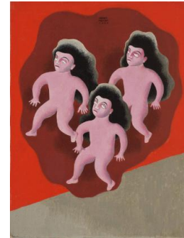
Title: Fuga (Escape) Date: 1940 Primary Maker: Carlos MÉRIDA Medium: oil on canvas