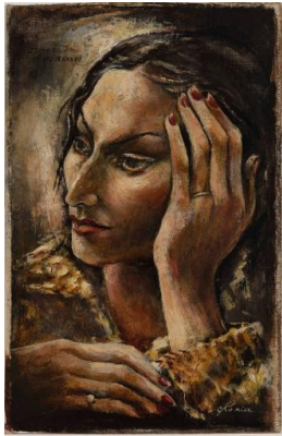
Title: Portrait of Gloria Date: 1937 Primary Maker: Federico Cantú Medium: oil on canvas mounted on wood panel