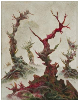
Title: Abstract of Trees Date: 1964 Primary Maker: Guillermo MEZA Medium: oil on masonite