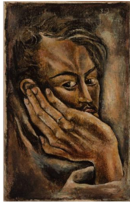
Title: Self-Portrait Date: 1937 Primary Maker: Federico Cantú Medium: oil on canvas mounted on wood panel