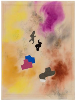
Title: Sky No. 1 Date: 1943 Primary Maker: Carlos MÉRIDA Medium: watercolor, gouache, ink on rice paper