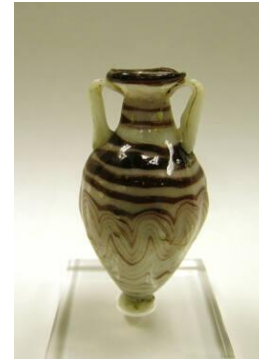
Title: Amphoriskos Date: 5th-4th century BCE Primary Maker: Eastern Mediterranean, Pre-Roman Medium: glass