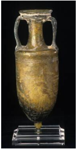
Title: Amphora Date: 300-350 CE Primary Maker: Roman, Eastern Mediterranean Medium: glass