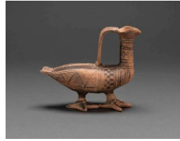
Title: Askos (oil flask) in the form of a bird Date: late 8th century BCE Primary Maker: Greek, Boeotian Medium: ceramic