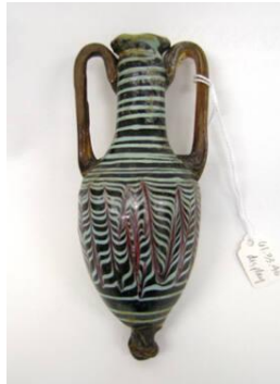
Title: Amphoriskos Date: 2nd-1st century BCE (late Hellenistic) Primary Maker: Eastern Mediterranean Medium: glass