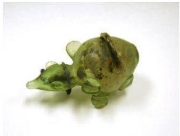
Title: Animal figure Date: 2nd-4th century CE Primary Maker: Roman, Eastern Mediterranean Medium: glass