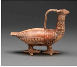
Title: Askos (oil flask) in the form of a bird Date: late 8th century BCE Primary Maker: Greek, Boeotian Medium: ceramic