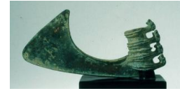
Title: Axehead Date: 1350-800 BCE Primary Maker: Persian, Luristan Medium: bronze