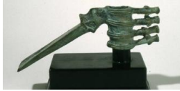
Title: Axehead Date: 1350-800 BCE Primary Maker: Persian, Luristan Medium: bronze