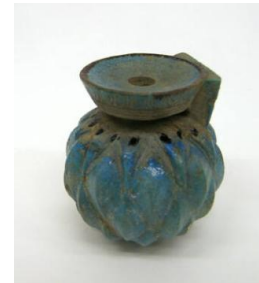
Title: Aryballos (cosmetic vessel) Date: Roman Period Primary Maker: Egyptian Medium: faience