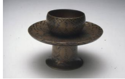
Title: Teacup Stand Date: Edo period, 18th century Primary Maker: Japan Medium: black lacquer on wood with gold and pewter nashiji-e and hiramaki-e