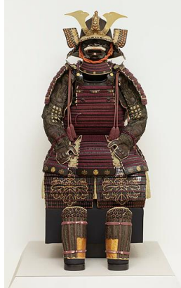
Title: Suit of Armor Date: late 16th - early 17th century Primary Maker: Japan Medium: Wood, Laquer, fabric, leather, metal, paint, 14 parts