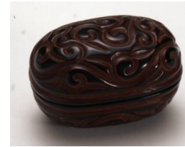
Title: Small Box Date: 17th-18th century Primary Maker: Japan Medium: wood with tixi carved red and black lacquer