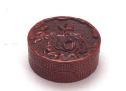
Title: Small Round Box Date: 18th century Primary Maker: China Medium: wood with carved red lacquer with peony on ground of chrysanthemum design