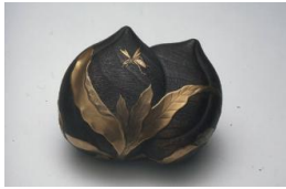
Title: Box in the Form of Double Peach Date: Edo period, first half of 19th century Primary Maker: Japan Medium: lacquer on wood decorated with gold takamaki-e