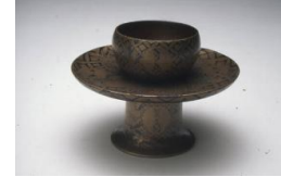
Title: Teacup Stand Date: Edo period, 18th century Primary Maker: Japan Medium: black lacquer on wood with gold and pewter nashiji-e and hiramaki-e